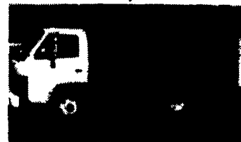
1988 GMC/Isuzu 4000 Dmp/Stke, 4 Cyl Turbo Dsl, 13,200 GVW, Auto, Florida Trks & Well Maintained (New Hoist & Body w/18 Mo Warranty) Economical & Ready To Work

TWO ACRES OF ALL TYPES USED TRUCKS. "IF WE DON'T HAVE IT, WE'LL GET IT"