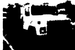
1983 Int'l S1700, 9.0 Dsl, 5 Spd, 26,000 GVW, 12' Stake Dump w/Tool Boxes, PS, Hyd Brakes, New Eng., Exec Cond., Under CDL

Just Off I-78, Between Allentown & Quakertown Financing Pre-Approved