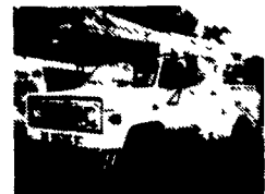
1982 Chevrolet C60, 350 V8, 4 Spd., Low Mi., 45' Bucket/Utility Owned & Maint. by Mun. Auth., Exec Cond Under CDL