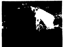
1987 MACK M3300, 20' Kidron/Thermo King KDII Reefer, 6 Cyl., DSL, 5 Spd., P/S, A/B, Radio and Curb Side door Well maintained & exec cond thru out Reefer Unit Independent w/Stand By Call Now!