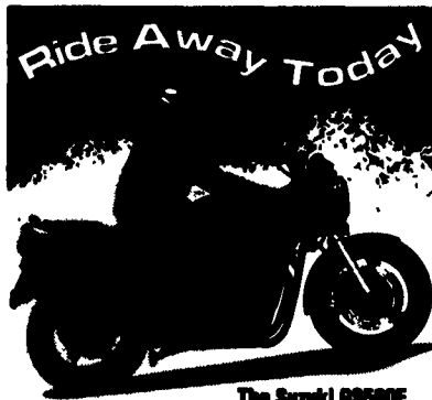
The Suzuki GS500E