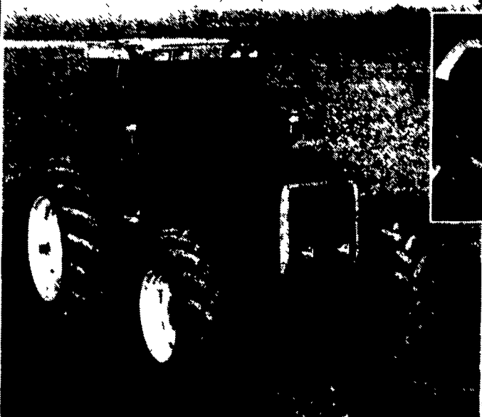
180 HP MF 8160