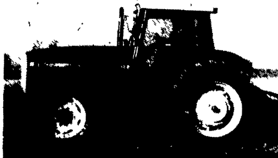
160 HP MF 8150