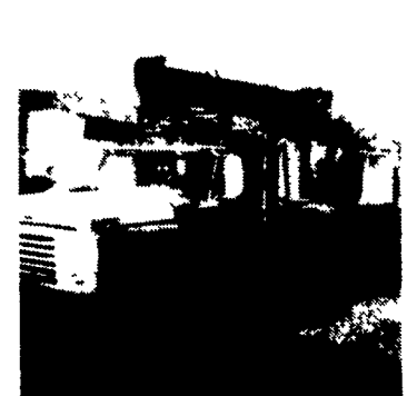
Need A Lift? We Have A Large Selection Of Boom Trucks Up To 14,000 lbs. Cap. Some With Post Diggers.