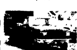
89 FORD F250 - 351 V-8, 5 Speed, PS, PB, No Air, 99,308 Miles $5,990