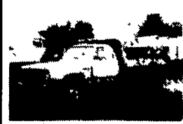
80 DODGE D-400 4x4 Dump, As Trade, Run Well, Not Perfect or Inspected $5,900