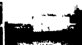
84 Ford F700 8.2, 5 Speed, 20' Box, 21,000 GVW, Average $4,990