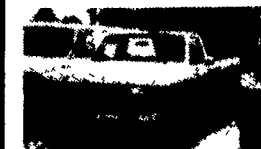
88 FORD F-250, 4x4, 8600 GVW, 351 V8, Auto, AC, 'R' Title $8,990