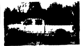
90 FORD F-350 CREW CAB, Dually 460 EFI, Auto, PS, AC, One Owner, 107,000 Mi. $12,900