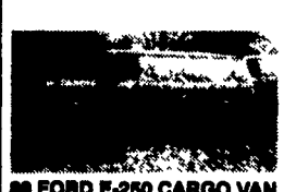
88 FORD E-250 CARGO VAN, 6 Cyl., Auto, AC, 102,000 Miles 4 to Choose From $3,990 - $6,990