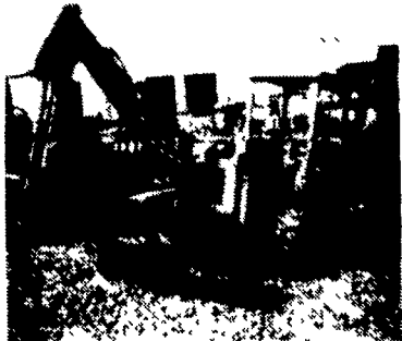
Vermeer M-470 Trencher with backhoe. This is one of six units we have all ready to work. Starting at $4,500.

Huntingdon Valley, PA • 215-672-9667 • 1-800-543-3833 • Eddie SPRING SALE DAYS