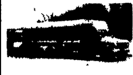
88 FORD 19 PASSENGER, Wheel Chair Lift 460 V-8, As Trade-Not Perfect $5,900