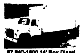
87 IHC-1600 14' Box Diesel, Nice $9,900