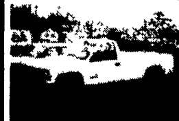
92 GMC 1500, 305 V-6, Auto, PS, No AC, 76,308 Miles, One Owner $7,990

15 LATE MODEL MINI VANS IN STOCK $3,750 to $11,900