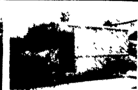
89 CHEV. P-30 18' Aluminum Step Van Grumman Body, 96,710 Miles $11,900