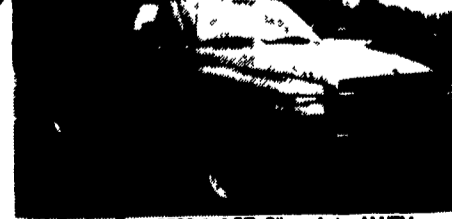
1995 Dodge Ram 2500 4x4 ST, Silver, Auto, AM/FM, 5.9L, Great Work Truck..... $18,995* (PA Farm Bureau Members)