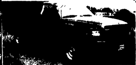
1995 Dodge Ram 1500 4x4 ST, Emerald Green, Auto, AM/FM, Air, 5.2L..... Clearance Priced $18,995

OVER $1,000,000 IN DODGE TRUCK INVENTORY CLEARANCE PRICED NOW THRU JUNE 30TH