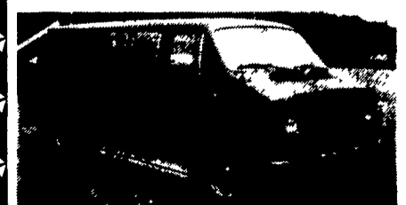
1987 Dodge Ram Van, 250, Dk. Blue, 75K, Air, Tilt, Cruise, Cass, Hitch, 360 V8, Running Boards..... $8,495