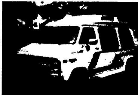
Vehicles & Boat Sold at 12:30