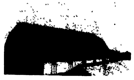
Use on Barns Or Garages