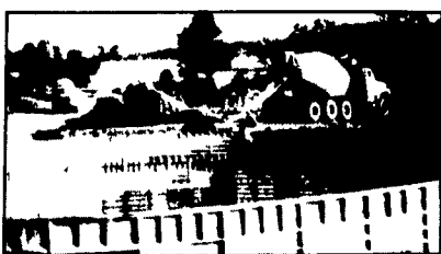
Construction Of Partially In-Ground Liquid Manure Tank - 400,000 Gallons