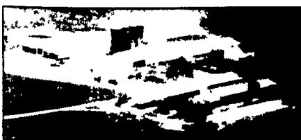
Far Left: 1-Million Gallon Circular Manure Storage Tank Far Right: 2 Silage Pits In-Barn Manure Receiving Pit

17 Years Experience In Pouring Concrete Manure Pits!