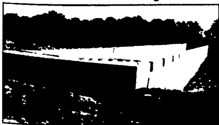
300' Long Manure Pit For Hog Confinement