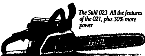
The Stihl 023 All the features of the 021, plus 30% more power