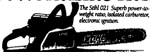
The Stihl 021 Superb power-to-weight ratio, isolated carburetor, electronic ignition.