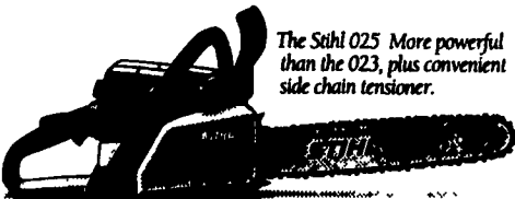
The Stihl 025 More powerful than the 023, plus convenient side chain tensioner.