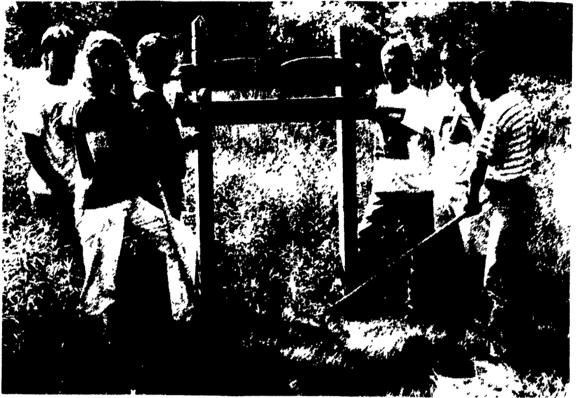
Bermudian Springs students inspect the environmental wetlands study area on campus.