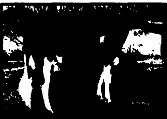
9H1644 JUMPSHOT Dtr: High Jumpshot 22 Grade 2-0 145d 9,546m 3.3% 313f 3.1% 298p Inc. Stephen High, Loysville, PA

When you want more milk--look to Sire Power's milk improvers. Their daughters will fill the tank and be built to last.