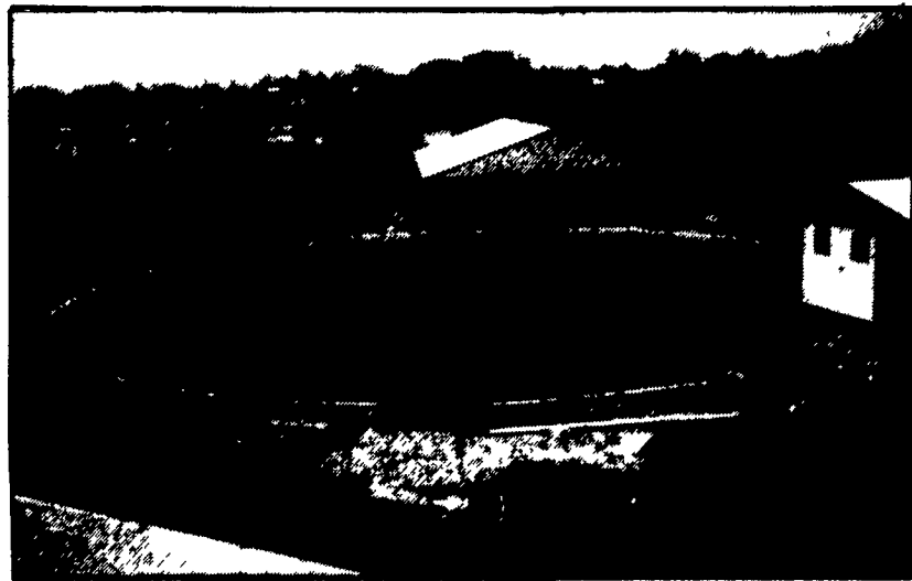
Partial In-Ground Tank Featuring Commercial Chain Link Fence (5' High - SCS approved)