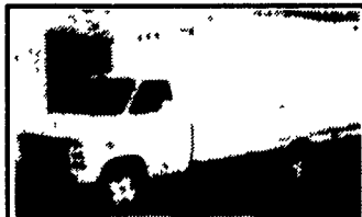
1988 C30 Chev - 14 Ft. Cube Van, V8, Auto, Inspected $6200.00