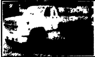
1990 Ford F800 - 429 Motor - 5+2 Spd., 28,000 GVW, 32,000 Miles, 102" C to A - Very Clean Truck

'90 Ford XLT F150 super cab, 300 EFI, 5 spd, PS, PB, PW, PDL, cruise, tilt, air, AM-FM cassette, black & silver w/matching fiberglass cap, 44,000 miles, new radials, excellent condition, $11,900. 717-733-2873