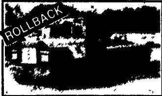
1970 Mack - 5 Spd. 237 Motor - Jake Brake, 56,000 GVW, 28 Ft. Rollback Tk. in Ex. Condition