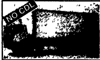
1989 MS 200 - 25,000 GVW (No CDL) Diesel, 24 Ft. Van Body Lift Gate, Inspected Super Clean Truck