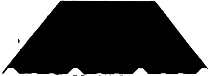
R Panel - 26 Gauge

Post & Frame Building Materials Metal Roofing our Specialty