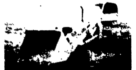
JD 450C crawler loader, new U/C, cleaned & painted $16,000