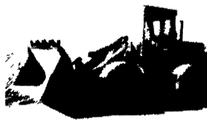
JD 644B $24,000

No Reasonable Offer Refused Custom Repairs On All Makes Industrial & Farm Equipment