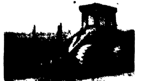
JD 544B with logging forks or bucket $22,000