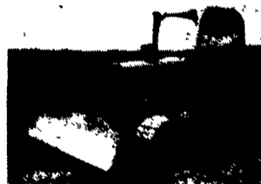
JD 550 with 6 way blade $17,000