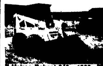
Melroe Bobcat 943 - 1990 - Low Hours, New Tires, New Paint, New Bucket, Very Nice $19,000