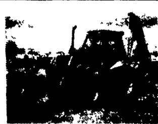
1988 Case 780D 4x4, Cab, Extendahoe, Very Low Hours, Clean Original $46,500 Will Consider Lease or Rent