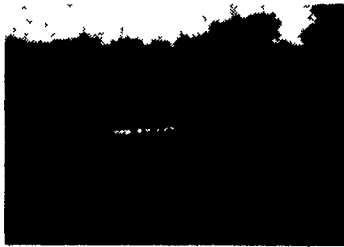
1972 Gallon 503 Series L Grader Diesel, With Scarifier, Nice Machine $14,500