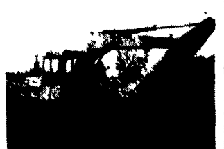
JD 690B Excavator 1978, Operating $21,500