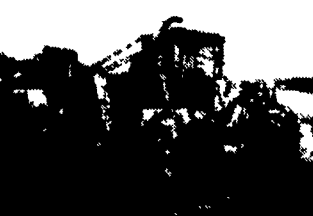
1990 Franklin 170 Skidder, Winch & Grapple $9,500

WANTED: Good Late Model Construction Equipment Need S/N And Price When You Call