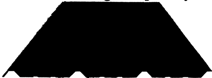
R Panel - 26 Gauge

Post & Frame Building Materials Metal Roofing our Specialty