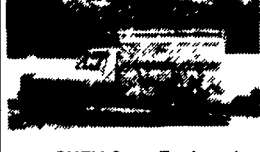
85 CHEV C-20, Enclosed Utility, 350 V-8, Auto *4,900