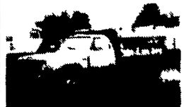
90 DODGE D-400 4x4 Dump, As Trade, Run Well, Not Perfect or Inspected *5,900