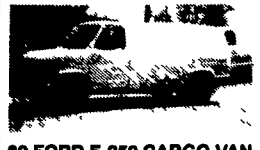
89 FORD E-250 CARGO VAN, 6 Cyl., Auto, AC, 102,000 Miles 4 to Choose From *3,990 - *6,990