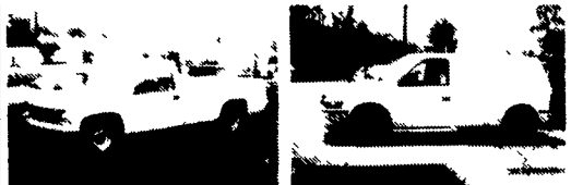
92 GMC 1500, 305 V-8, Auto, PS, No AC, 76,308 Miles, One Owner *7,990

15 LATE MODEL MINI VANS IN STOCK $3,750 to $11,900