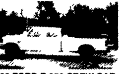
90 FORD F-350 CREW CAB Dually 460 EFI, Auto, PS, AC, One Owner, 107,000 Mi. *12,900