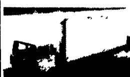
82 MACK DIESEL, 24' Morgan Box w/Power Lift Gate, Ready to Work *5,490