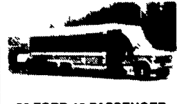
88 FORD 19 PASSENGER, Wheel Chair Lift 460 V-8, As Trade - Not Perfect *6,700