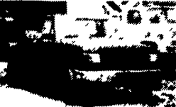
89 FORD F250 - 351 V-8, 5 Speed, PS, PB, No Air, 88,308 Miles *5,990