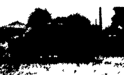
87 FORD E-150 CARGO VAN, Ugly But Functional *2,475