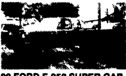
90 FORD F-250 SUPER CAB, 8800 GVW, 4x2 *6,990