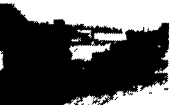
87 FORD CF 6,000 Cab & Chassis, 6 Cyl., Diesel, 5 Speed, 26,500 GVW, 157,000 Miles *8,900