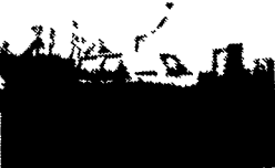
90 FORD CREW CAB 4x4 480, Auto, PS, AC, Only Average, Ready To Work *9,900