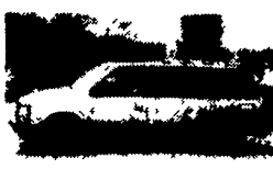
88 PLYMOUTH GRAND VOYAGER 7 Passenger, 4 Cyl., Not Perfect *2,990