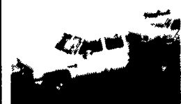
87 CHEV 30 SERIES 4X4, Crew Cab, Cab & Chassis 484, 4 Speed, AC, Nice! *9,900