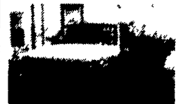
90 Chev C-2500 Work Truck, V8, Auto, PS, AC, 70,104 Miles *7,990