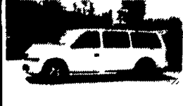
92 DODGE GRAND CARAVAN, 7 Passenger, Auto, AC, Local Trade, 66,205 Miles *8,990