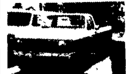
88 FORD F-250, 4x4, 8800 GVW, 351 V8, Auto, AC, 'R' Title *8,990