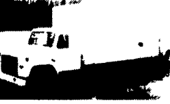
87 IHC-1600 14' Box Diesel, Nice *9,900