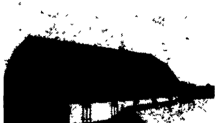
Use on Barns Or Garages