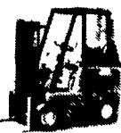
5,000 lb. Clark $4,500