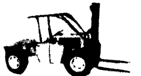
Clark Ranger 4WD $7,000