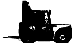
15,000 lb. Hyster $15,000