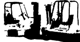
2500 lb. Hyster $4,500 & $3,000