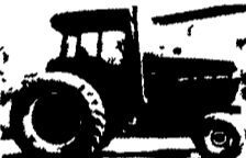
Magnum 7110 ('92) Low Hours Was $44,000 Now $42,500 With Warranty