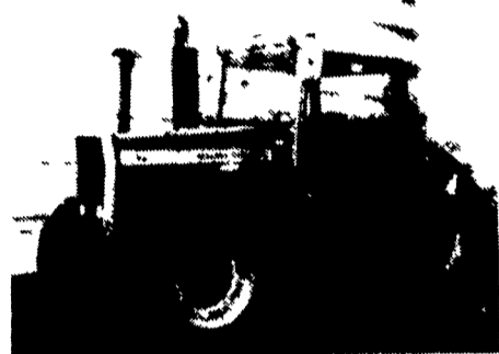
MF 3545, 3,200 Hrs., 20.8-38 Tires $23,500.00