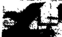
Deutz-Allis Baler, 5 X 6 Soft Core, Auto Electric Tie $7,990 $6,500