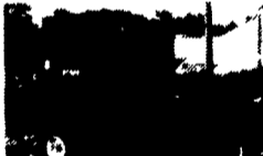
Gehl 1470 Baler, 4 X5 Bale, Electric Tie, Reduced To $9,900