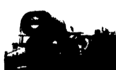
MECHANICAL TRANSPLANTER 2 Row Pull Type $995