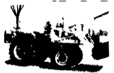
FIAT HESSTON 780 TRACTOR w/Loader, 4WD, 70 HP, Diesel - $13,200

Bush Hog 3126 Rotary Mower 10' Pull Type - $5,300 NI 4 Row Corn Planter w/Fertilizer & Extras - $13,500 Gehl 9 Ft. Mower - Conditioner $8,000 Gehl 4x5 Round Baler $9,900 New Idea Bar Rake, 8'6" Hyd $2,900 Case D130 Backhoe for Skid Steer 10 Ft. Frame Mount w/Bucket - $6,500