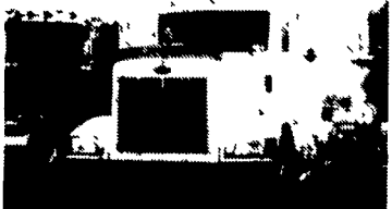
1988 PETERBILT 377, 3406-350 CAT, RT 14609A, DS 400 R Axle, 3 55 Ratio, Peterleaf Susp, 36" Sleeper