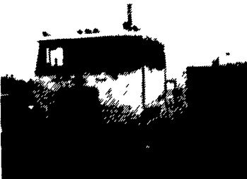
1988 PETERBILT 362-90" 340GB 350 Cat, RTX 1409B Trans, DS402- 4 33 Axle, Pete Low Air Leaf Suspension