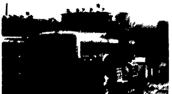
1988 PETERBILT 379-36", 3406B - 350 Eng, RT014613 Trans, DS402-3 70 R Axle, Pete Air Leaf Susp