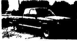
'92 Ford Ranger X-Cab XLT 2WD, 3.0 V6, 5 Spd., 65,448 Miles, Flood Damage Engine, Has Noise, Otherwise Very Little Damage $5,950