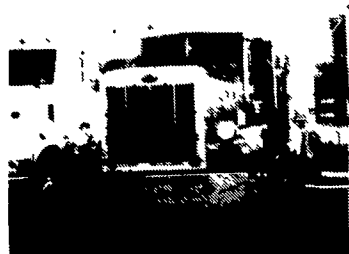
1982 PETERBILT 359 30406 400 CAT, RT014613 13 Speed, Rockwell SQ 100 R Axle 3.90 Ratio, Peterleaf Susp., Wet Line