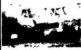
'93 GMC G-3500 Panel Van 6.2 Diesel, 94,000 Mi., Front Right Damage $3,900