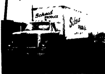
1979 GMC BRIGADIER 3208 Cat 210 HP, 5 Speed, 2 Speed Rear, 48,000 Lb GVW, Tag Axle, 20 Van Body