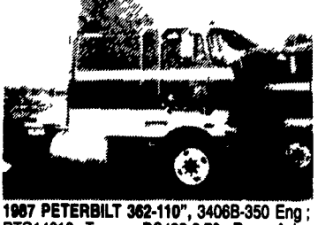
1987 PETERBILT 362-110", 340GB-350 Eng; RT014613 Trans, DS402-3 70 Rear Axle, Peter Air Leaf Susp