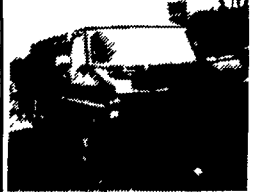
'90 Chevy Beauville Ext. Van 15 Pass., 350, Dual AC, Cassette, 83,000 Mi.