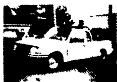
'94 Ford Ranger XLT Ext. Cab, 2.3L, 5 Spd., AC, 11,000 Mi. $5,800