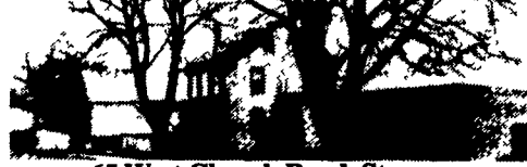
65 West Church Road, Stevens 2-1/2 STORY FRAME HOME

Directions: From Ephrata take Route 322 West, turn right on Durlach Road (at Horst's auction center) follow Durlach Road to Mt. Airy, turn left on W. Church Road to property on right Clay Township, Lancaster Co.