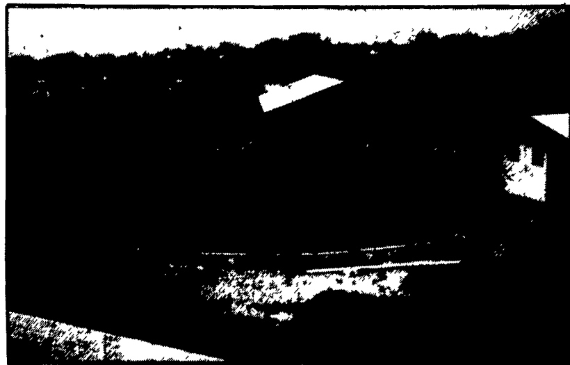
Partial In-Ground Tank Featuring Commercial Chain Link Fence (5' High - SCS approved)