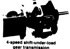
4-speed shift-under-load gear transmission