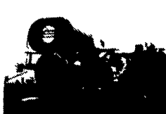
MECHANICAL TRANSPLANTER 2 Row Pull Type $995