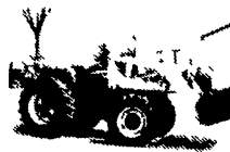
FIAT HESSTON 780 TRACTOR w/Loader, 4WD, 70 HP, Diesel - $13,200