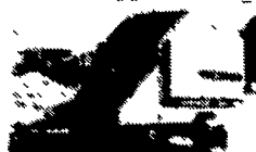
Deutz-Allis Baler, 5 X 6 Soft Core, Auto Electric Tie $7,999 $6,500