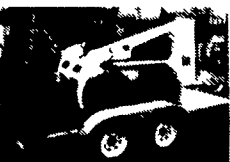
BOBCAT 753 SKID STEER Kubota Diesel, 500 Hours, One Year Old - $14,400