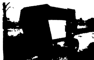
N.H. 853 Round Baler w/Bale Command, 5'x4 3/4' Bale