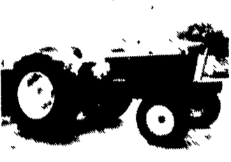
Ford 5000D, one owner $6,900