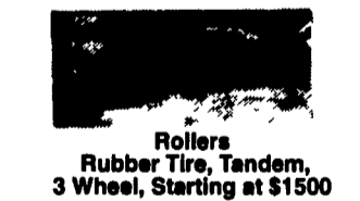
Rollers Rubber Tire, Tandem, 3 Wheel, Starting at $1500

JUST IN... Raygo Romper Roller Model 2-36, gas, vibratory