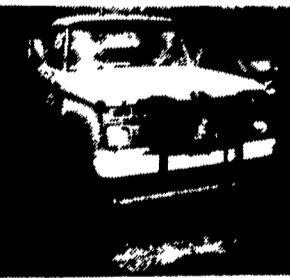
1966 F350 DUMP, V8 352, Gas, 4 Spd., 8' Snow Plow $3,500