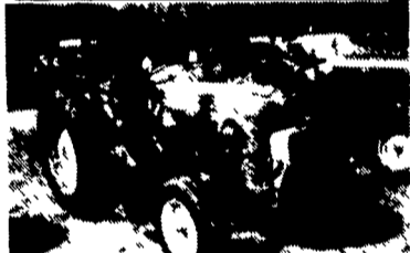
Clean Ford 601 Tractor w/Hydraulic Drive Triumph Sickle Bar Mower