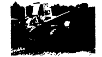
644 LULL 4WD, 4 Wheel Steer - Shooting Boom Perkins Diesel - 6000 Lb. 34' Reach $24,500

Many Pieces Not Listed! If You Don't See It - Give Us A Call!