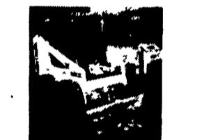
1989 443 BOBCAT, 1681 Hrs., Diesel $5,000

Many Pieces Not Listed! If You Don't See It - Give Us A Call!