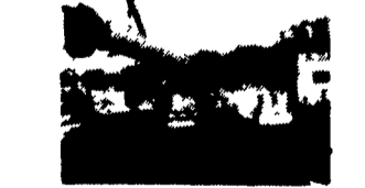
CRANES - CHERRY-PICKERS RT-58 Grove - Detroit Power 60' Boom - Cab - 4x4 - 14 Ton $17,500 125 Gallon - Gas 60' Boom Jab - 4x4 - 12 1/2 Ton $10,000