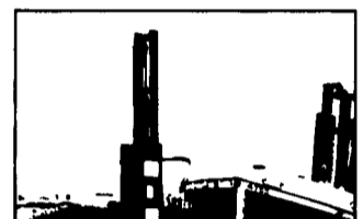
Shaver Post Drivers In Stock

Shaver Post Drivers In Stock • HD 101 Complete $1,750 • HD 102 Complete $1,750