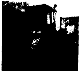
TROJAN 1500Z EROPS, Bucket & Forks $22,500