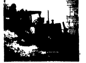
1986 JD 210C TLB, OROPS, 3117 hrs, nice tractor $14,750

We Buy & Sell Huber Maintainers For Parts M-52's-500's-600's-700's-800's