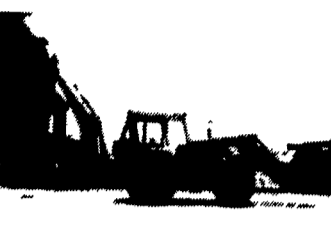
Ford 5550 Tractor/Loader/Backhoe $6,900