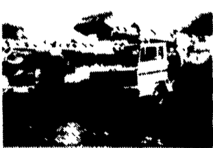
GRADALLS G-440 - Ford Gas Down Det. Diesel Up Remote; $12,500 G-600 - Det. Diesel Up & Down Remote $8,500