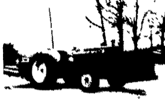
Ford 2000, 2400 Hrs, Snow Plow, Woods C80 Mower