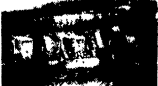
HUBER MAINTAINERS M-500 Gas... $5,500 M-600 Gas... $17,500 M-650 Diesel, Front Blade, Wide Tires