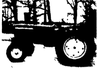
JD 4020 (Local Tractor) $6,600