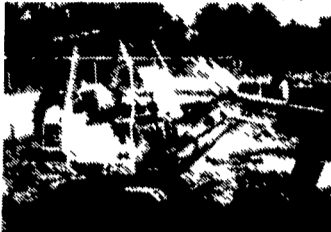
JD #15 Mini Excavator... $5,900