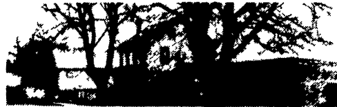
65 West Church Road, Stevens 2-1/2 STORY FRAME HOME

Directions: From Ephrata take Route 322 West, turn right on Durlach Road (at Horst's auction center) follow Durlach Road to Mt. Airy, turn left on W. Church Road to property on right Clay Township, Lancaster Co.