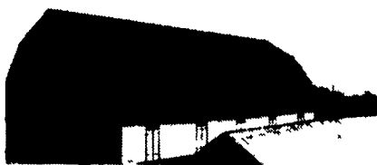
Use on Barns Or Garages