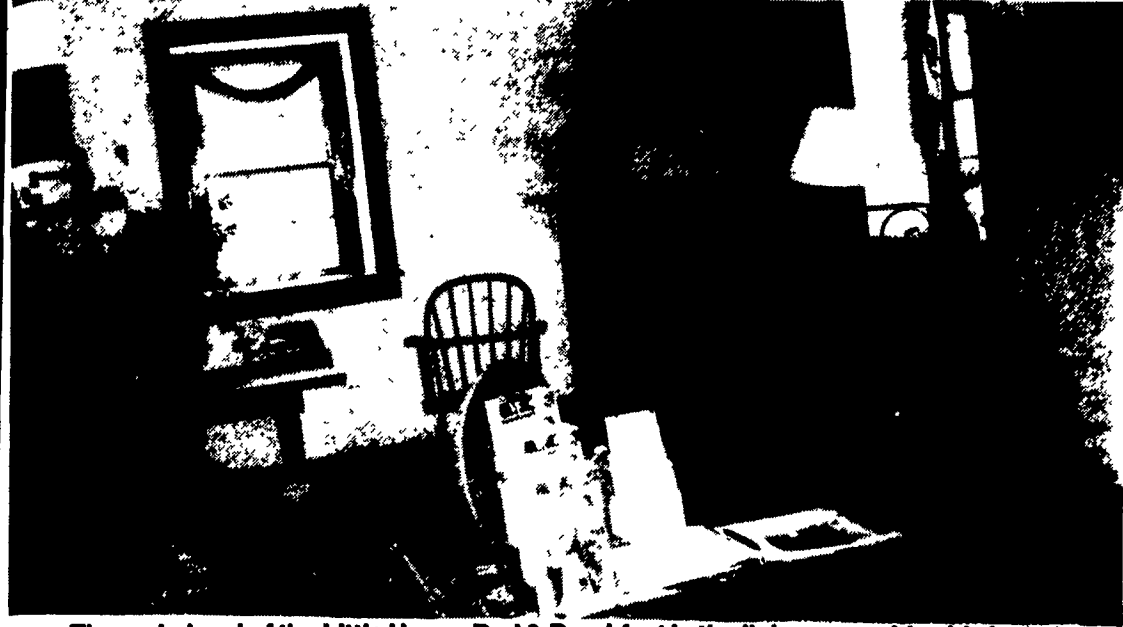
The main level of the Little House Bed & Breakfast is the living area with wide board floors, open beam ceiling and fireplace. The lower level provides a complete kitchen with room for dining in front of the open hearth. Climb the narrow stairs to a cozy loft bedroom that overlooks miles of rolling valleys.

For information about the Little House Bed & Breakfast of Oley Valley, write to David and Lorin Tuttle at 675 Covered Bridge Rd., Boyertown, PA 19512 or phone (610) 689-4814.