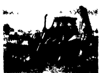
1988 Case 780D 4x4, Cab, Extendahoe, Very Low Hours, Clean Original $47,500 Will Consider Lease or Rent