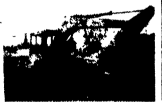
JD 690B Excavator 1978, Operating $22,500