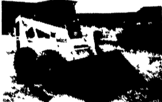
Melroe Bobcat 943 - 1990 - Low Hours, New Tires, New Paint, New Bucket, Very Nice $20,000