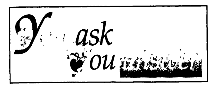
(Continued from Page B5)

QUESTION — A reader wants to know where to purchase extra strong flat webbing for lawn chairs.