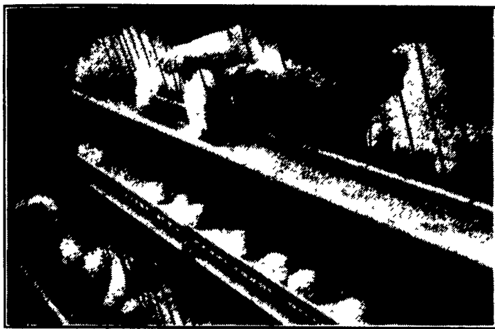
BIG DUTCHMAN LAYER AND PULLET CAGE SYSTEM