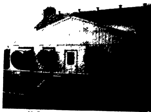
42 Cow Tie Stall Barn - Leola, PA

Lapp's Barn Equipment can install a high-performance/high efficiency tunnel ventilation system in your barn. A tunnel ventilation system will give you an even air flow throughout your barn of 2-5 mph. This gives you the advantage of better controlling temperature to give your cows more comfort which means more milk! Also, a tunnel ventilation system eliminates circulating fans, provides summer and winter ventilation and controls fly problems! An optional unit can even automate your ventilation so you will never even have to worry about it when you're not there, so you can concentrate on other things! At Lapp's, we sell high quality ventilation systems manufactured by Acme Engineering. Acme products feature such things as: