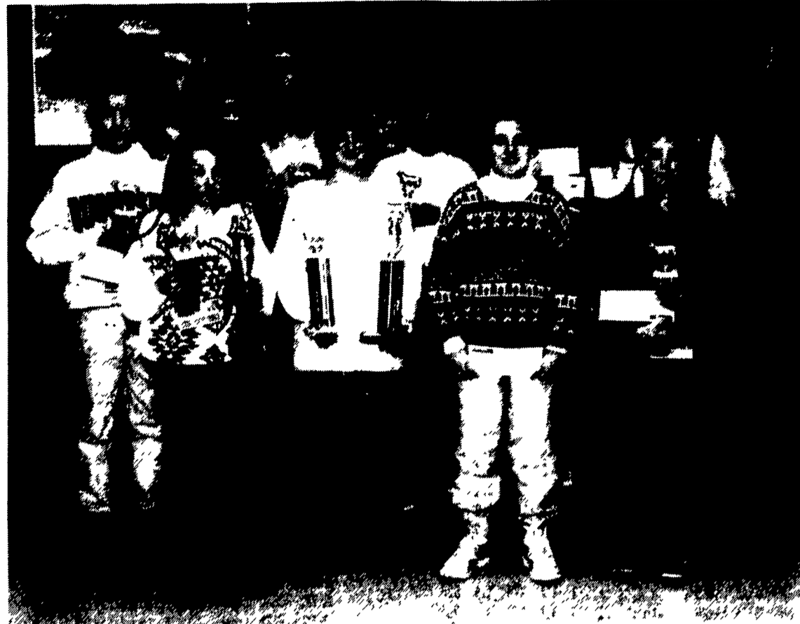
Sheep club award recipients at the Chester County 4-H Livestock Award program.