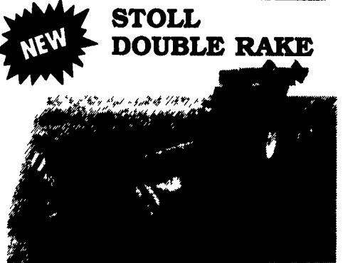
Hyd. Fold Tow Type Rakes 21'8" THE VERY FINEST IN HAY RAKES

TODD FARM EQUIPMENT, Inc. (Equipment Distributors) FOR OVER 75 YEARS FARM EQUIPMENT DIVISION HAGERSTOWN, MD (301) 791-0422