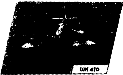
10' Tedder Gentle Action/13' Rake-Saves Leaves