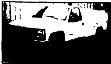
'95 3500 SERIES CHEVROLET Cab & Chassis of Utility Body 2 In Stock