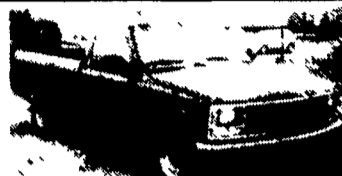
'90 CHEVY C1500 4x2, AT, Red, 39,000 Mi. (P409)