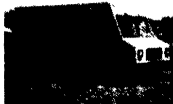
1991 FORD STEP VAN 7.3 Liter Diesel, 5 Speed Trans., 16,000 G.V.W. 135,000 Miles $14,900