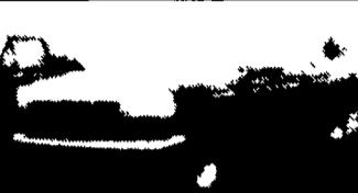
'92 FORD F150 4X2, Supercab, XLT, Auto., Loaded (6052A)