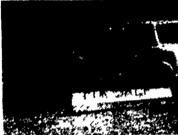
1990 Ford F250 4x4 Super Cab, 351 V-8, Auto, XLT, Myers Snow plow, 68,000 Miles $15,800