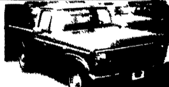
'86 FORD F150 4X2 XLT, 302 V8, AT, Short Bed, Sharp!! (4234B)