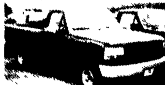
'92 FORD F150 4x4 6 Cyl., AT, 22,000 Mi (6120A)