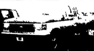
'89 FORD F-250 4X2, Supercab, V-8, Auto., XL (F107)