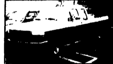
'92 FORD F-150 4x4 Extended Cab, XLT, AT, AC, Loaded