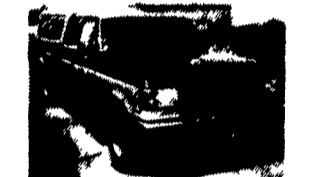
'89 FORD F150 SUPERCAB 4x4, 302 V8, 5-SPD., XLT, MATCHING CAP, EXTRA CLEAN (6130A)