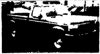
'95 FORD F250 XLT, 4x4 7.3 Power Stroke Diesel, 5 Spd., A/C HARD TO FIND