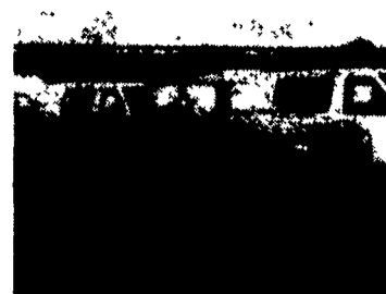
1989 FORD F250 460 V8, Auto, AC, AM-FM, Only 40,000 Miles $11,400