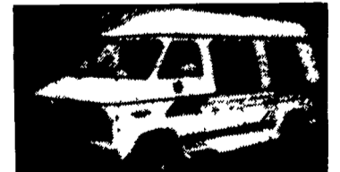
CHEVROLET CONVERSION VANS • Mark III • Midway • Roman Wheel • Trade Winds • Country Coach