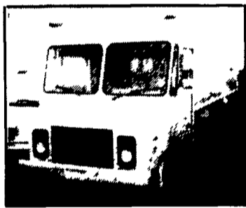
GRUMAN STEP VAN 2 In Stock