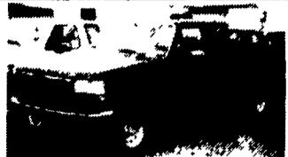
'95 FORD F150 SUPER CAB 4x4, Loaded 8 TO PICK FROM