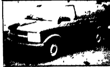
'95 ASTRO CARGO'S Auto, V-6 23 in Stock