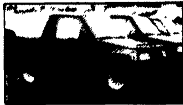
'95 GEO TRACKERS 84 IN STOCK