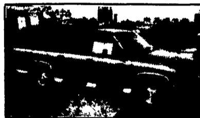
'95 CHEV SUBURBAN Loaded 'JUST ARRIVED'