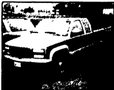
USED '93 GMC K3500 Dual Rear Wheels, V8, 4x4, Loaded, Low Miles