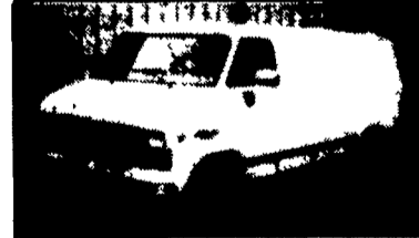
'93 CHEVROLET FULL SIZE CARGO VANS 3 in Stock