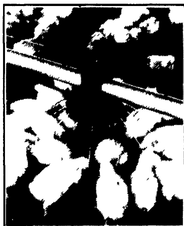
BIG DUTCHMAN BROILER SYSTEMS