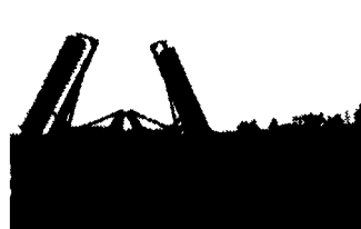
Brillion 27 Ft. Packer