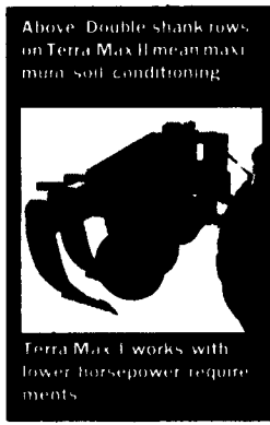
Above: Double shank rows on Terra-Max II mean maximum soil conditioning

Adjustable, 20" spring-loaded coulters slice the residue.