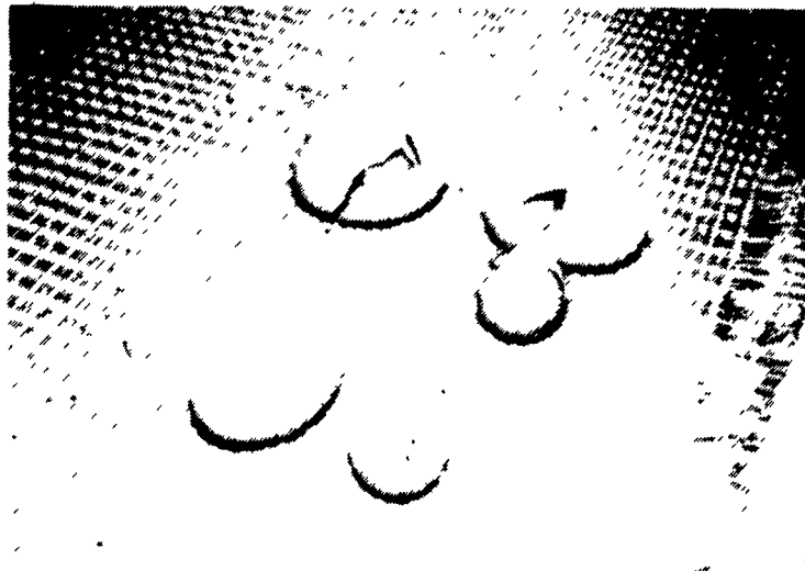
For the first time in almost 30 years of raising chickens, the Huegals found eggs that contained a perfectly formed egg within an egg in addition to a yolk and white.