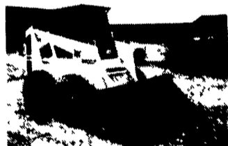
Melroe Bobcat 943 - 1990 - Low Hours, New Tires, New Paint, New Bucket, Very Nice $20,000