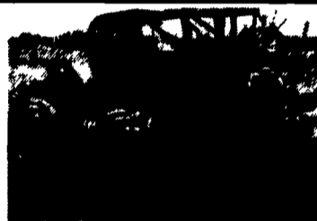
Athey S70 Log Skidder, Diesel, Winch, Needs Paint, Running Condition $5,900