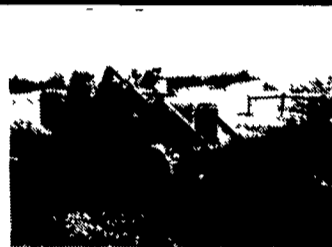
CAT 933-42A Crawler Loader, Very Clean For Age $8,900