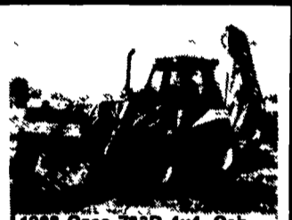
1988 Case 780D 4x4, Cab, Extendahoe, Very Low Hours, Clean Original $48,500 Will Consider Lease or Rent