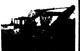
JD 690B Excavator 1976, Operating $22,500