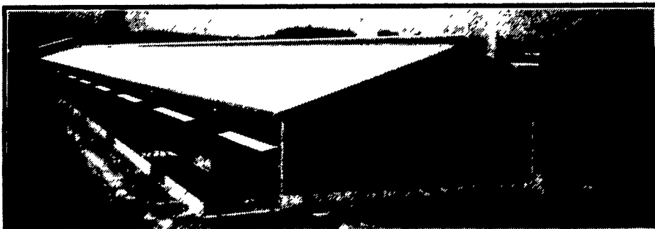
Slatted Beef Barn