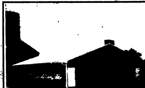
Slatted Hog Barn