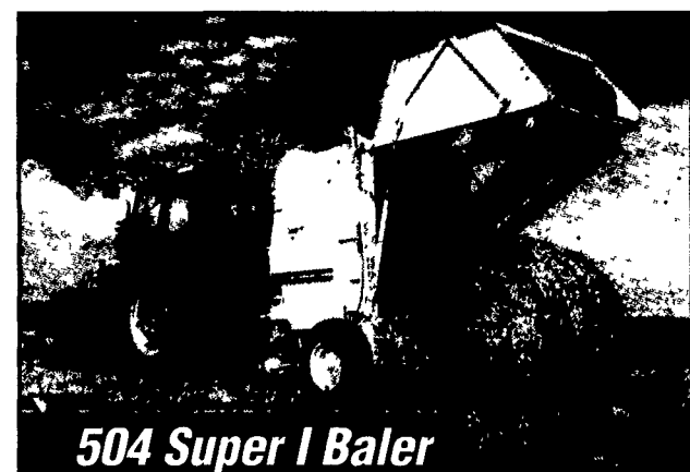
504 Super I Baler

Produces 5-foot-diameter, 5-foot-wide bales that weigh up to 1400 lbs, depending on moisture content. Very popular among operators who want the quality and value of a bigger bale system.