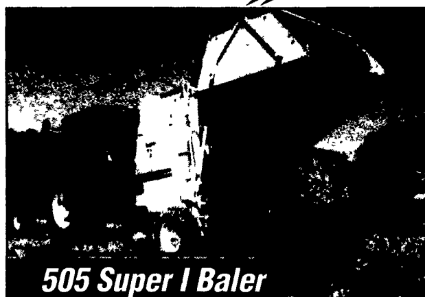
505 Super I Baler

Now Available! Now, Optional High-Density Belt Tension System For Tighter Bales That Hold Their Shape