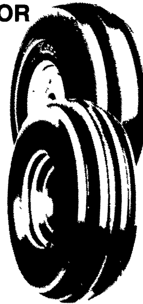
Champion Guide Grip <sup>TM</sup>