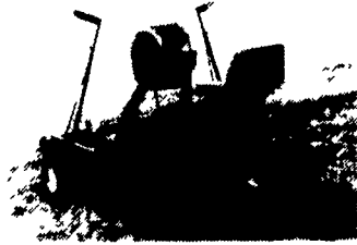
SUPER DELUXE FLATBED MULCH LAYER