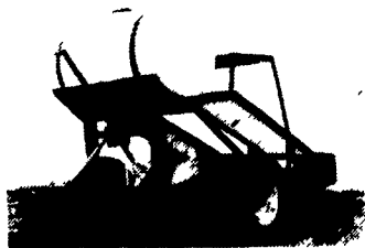
MODEL P150T WATER WHEEL PLANTER