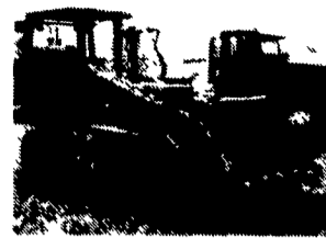
'87 Case 455C Loader GP Bucket, ROPS Canopy & Sweep.....$25,000