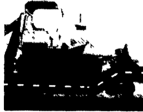
'86 John Deere 550B 6-way Dozer ROPS Canopy..$22,500