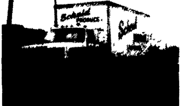
1979 GMC BRIGADIER 3206 Cat 210 HP, 5 Speed, 2 Speed Rear, 48,000 Lb GVW, Tag Axle, 20' Van Body