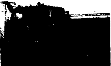
1981 FREIGHTLINER Cummins Big Cam 350 HP, Fuller RT 9509H 9 Speed Trans., Rockwell SQ HD, 4 11, Air Suspension