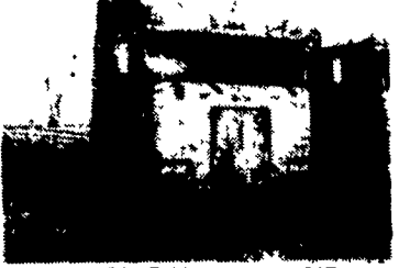
1990 PETERBILT 362, 90" BBC; CAT 3176, 325 HP; BFA 12F4 Front Axle, 12,000 Lbs.; Eaton DS 402 Rear, 40,000 Lbs., RT012609B Trans., Peterbilt Low Air Leaf