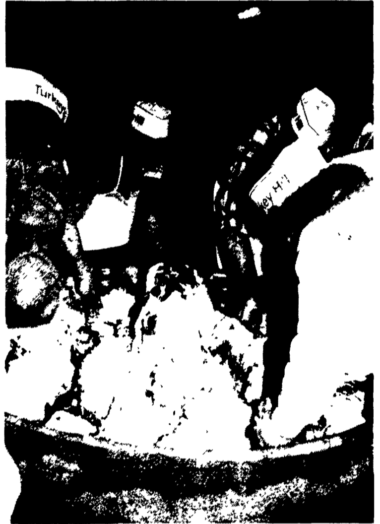
The "Huge" Turkey Hill Store Sundae was served to more than 2,600 people at the mall show.