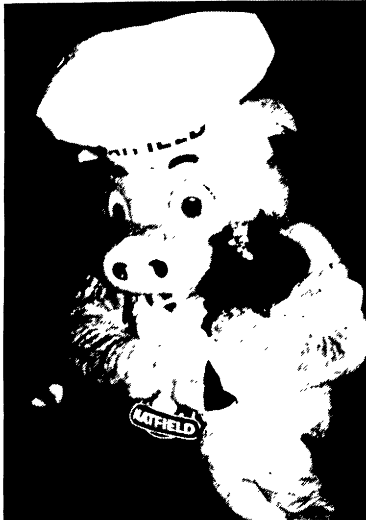
Smiley the Hatfield Pig was a big hit at the Mini Farm Show.

Education of the non-farm consumer was on the mind of the ladies in the planning of the show. All of the major players in agriculture in the Lehigh Valley were pre-